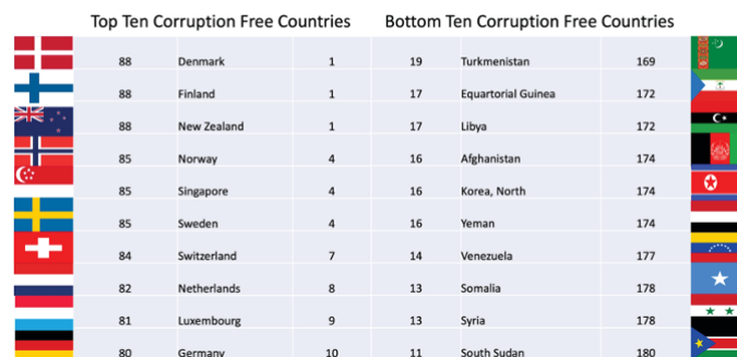
Transparency International Corruption Perceptions Index 2021

Transparency International’s Corruption Perception Index (CPI) measures corruption level in the public sector in 180 countries, designating 100 for very clean and 0 for highly corrupt. Of these countries, El Salvador is ranked 115 with a CPI of 34; Central African Republic (CAR) is 154 with a CPI of 24; Panama is 105 with a CPI of 36 (International, 2021). Why are these countries highlighted in this piece? El Salvador has made Bitcoin legal tender. The CAR recently passed a bill stating its intention to adopt cryptocurrencies and move away from their native fiat currency the CFA. Panama’s National Assembly recently passed legislation regulating the use of bitcoin and eight other cryptocurrencies when paying taxes and for private transactions.